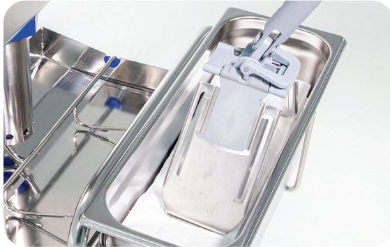
Insert a Saturix Mop Frame into a Saturix Microfiber Mop