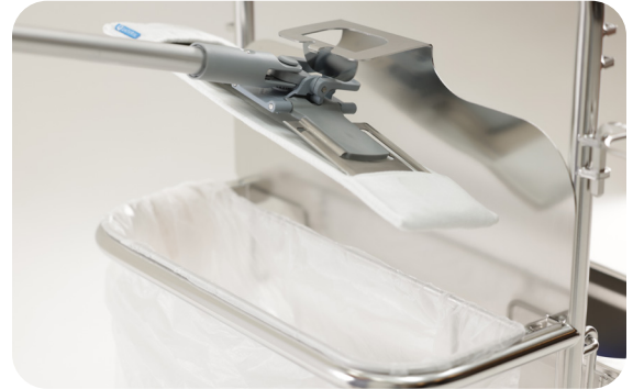
Remove with pressure—dirty mops fall into a waste bag