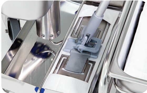
Precisely dose one mop at a time in a matter of seconds