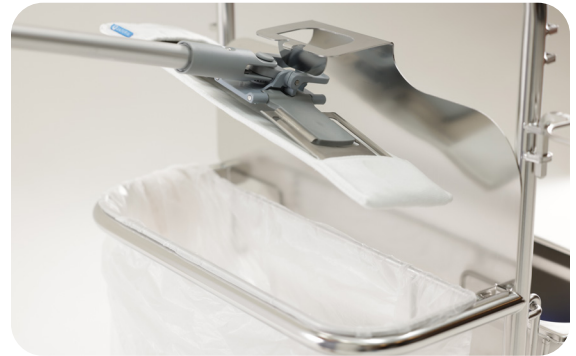
Remove with pressure—dirty mops fall into a waste bag