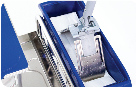
Insert a Saturix Mop Frame into a Saturix Microfiber Mop