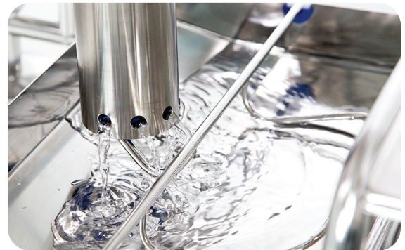
Depressing lever with mop releases the exact amount of liquid