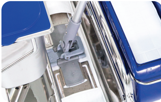
Precisely dose one mop at a time in a matter of seconds